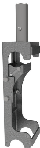
Locking Intermediate Horizontal Adapter with Pin (2016–Present, Run 57 – Run 60)