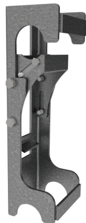
Locking Intermediate Horizontal Adapter with Slide Lock (2016–Present, Run 57 – Run 60)